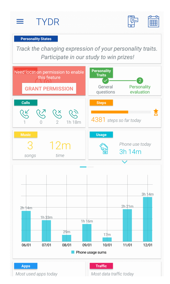
Fig. 1. Main screen of TYDR.

The process at the top of the figure shows the main menu of TYDR (Process 1), also cf. Figure 1. From here, the user can enable permissions (cf. Table 2 and Figure 1; PM G), which influences the data collection. The user can also fill out the general